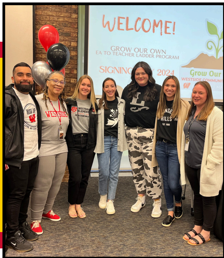
Grow Our Own Cohort 1 Graduates Spring, 2024

Not only is tuition funded through Westside Community Schools and donors, but also included is: University issued iPad, books, and support through mentors and university resources.